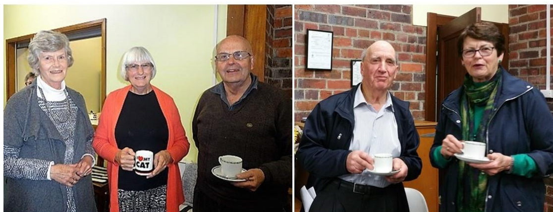
Thanks to all who attended the Launceston Branch AGM.