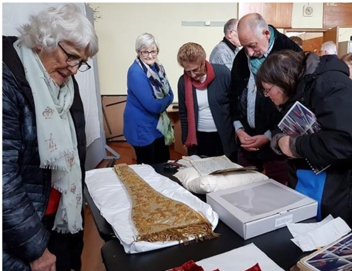
Members examining heritage exhibits